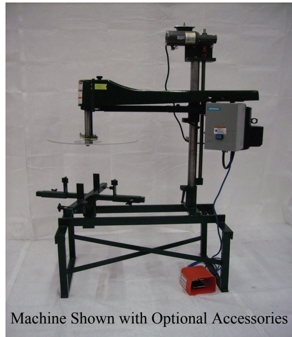
Machine Shown with Optional Accessories