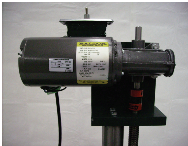
Machine Shown with Optional Accessories