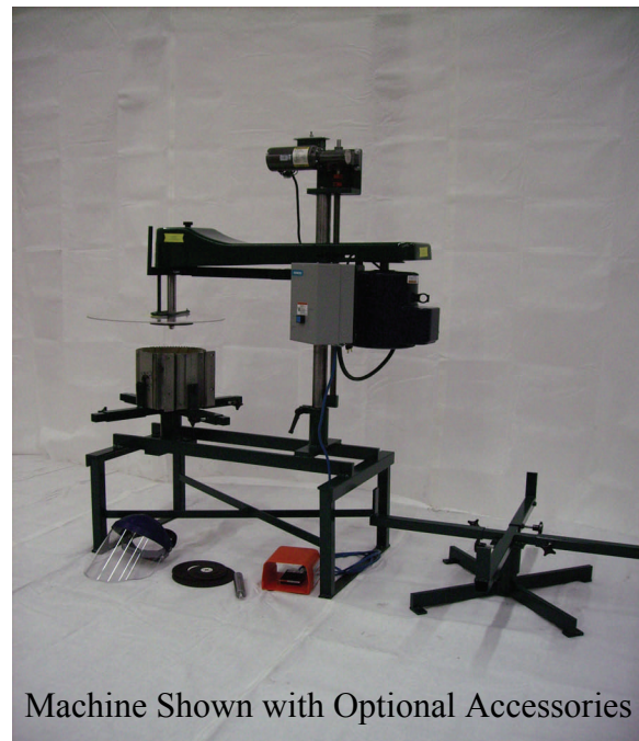
Machine Shown with Optional Accessories

TURNER INDUSTRIES, Inc. 12028 COUNTY HIGHWAY B CHIPPEWA FALLS, WI 54729 PHONE (715) 288-6480 FAX (715) 288-6956 www.turnerindustriesinc.com