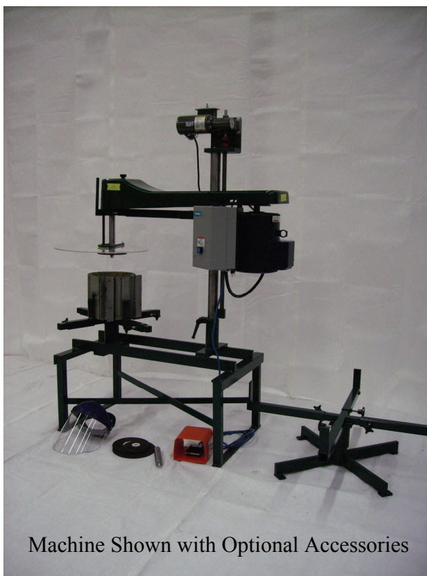
Machine Shown with Optional Accessories